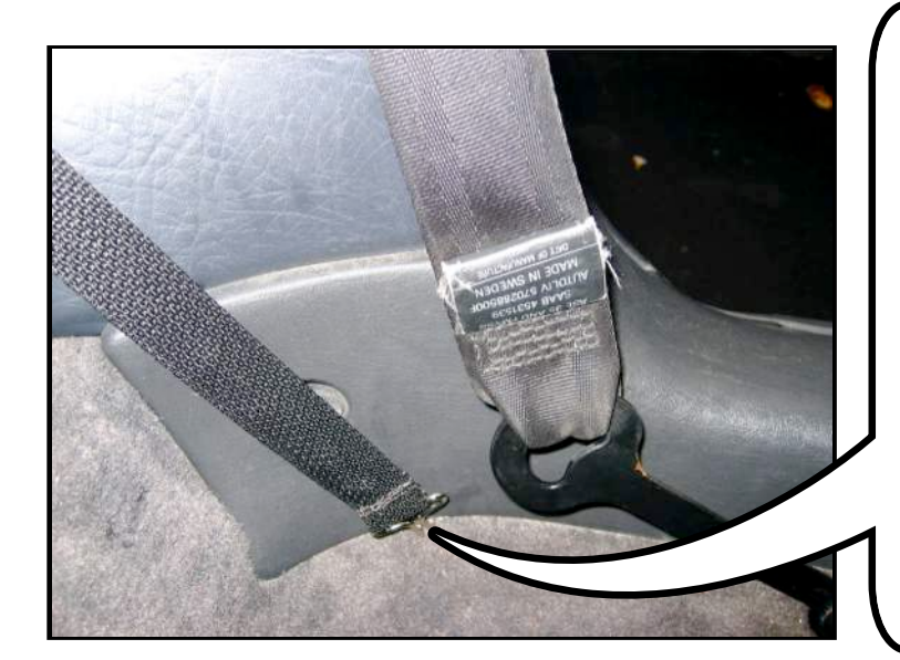
Attach the silver hook straps to the trim panel straight down, just behind the seat belt base. Then pull both straps down snugly.